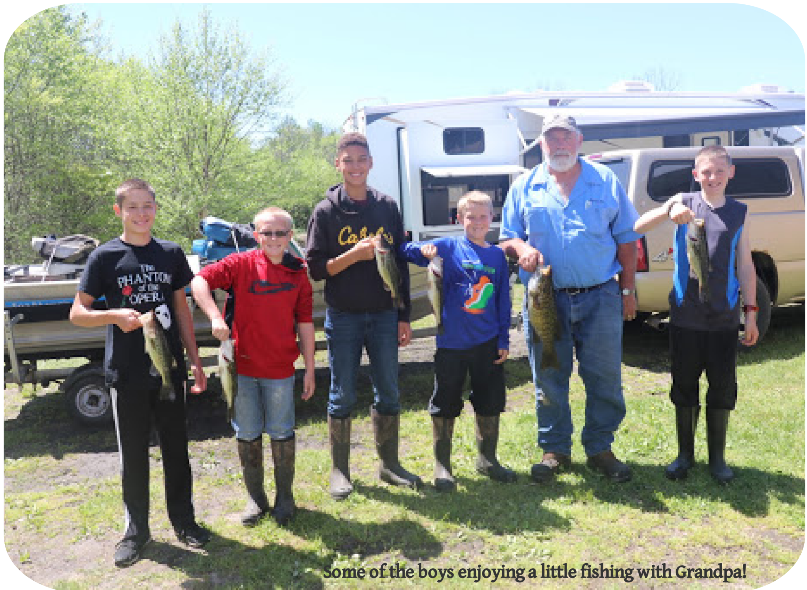
Some of the boys enjoying a little fishing with Grandpa!

We have experienced many challenges along the way...some that we've talked about already and some that are too recent and will be part of the testimony of our kids in the future! Along the way, it has been the Word that has gotten us through every obstacle. Verses such as Exodus 14:14 (the Lord will fight for you, you need only to be still), Romans 8:26 (the Spirit helps us in our weakness), Joshua 1:9 (be strong and courageous, do not be afraid for the Lord your God is with you wherever you go), 1 John 4:19 (we love because he 1st loved us), Romans 8:28, Deuteronomy 31:6, Psalm 12:6-7, 1 Corinthians 5:17, Isaiah 41:10, Jeremiah 29:11, Isaiah 60:22 and so many more. Also, we are so thankful for our massive support system and the many prayer warriors that pray for us through this journey called life.